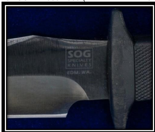
MIDNITE/GUN BLUED, EDMONDS, WA. PRODUCED 1990-1994