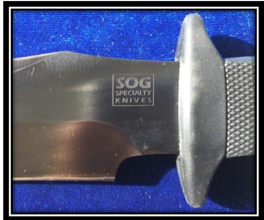
MIDNITE/GUN BLUED, LYNNWOOD, WA. PRODUCED 1994