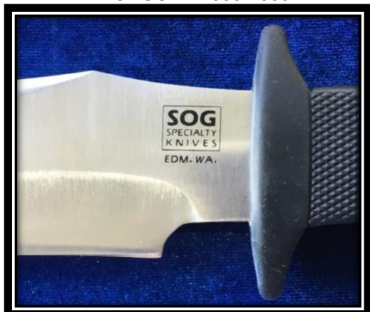
MODEL: N/A, SATIN, EDMONDS, WA. PRODUCED 1990-1994