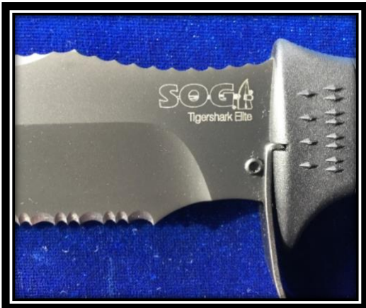
TIGERSHARK ELITE 2.0, MODEL: TE02, TiNi COATED W/2" SERRATION, LYNNWOOD, WA, PRODUCED 2008-2013