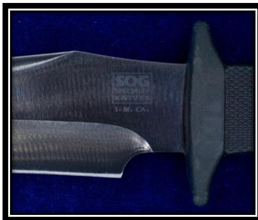
MIDNITE/GUN BLUED, SANTA MONICA, CA. PRODUCED 1988-1989 (AKA MIDNITE TIGER)