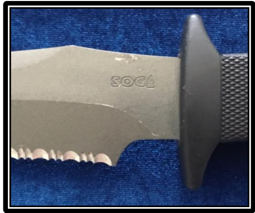
MODEL S5, POWDER COATED W/2" SERRATION, LYNNWOOD, WA, PRODUCED 2007