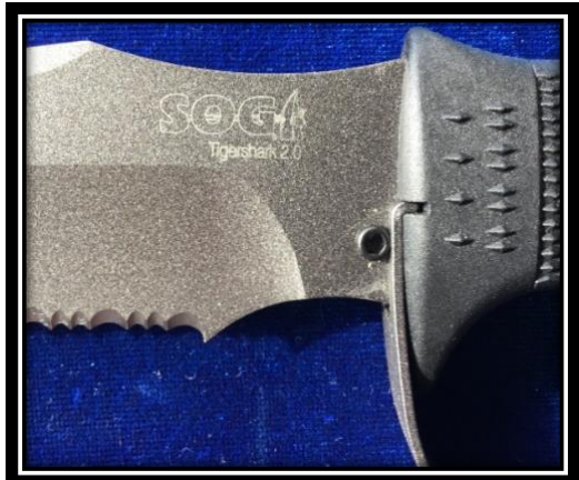
TIGERSHARK 2.0: MODEL TE01, POWDER COATED W/2" SERRATION, LYNNWOOD, WA, PRODUCED 2008-2011