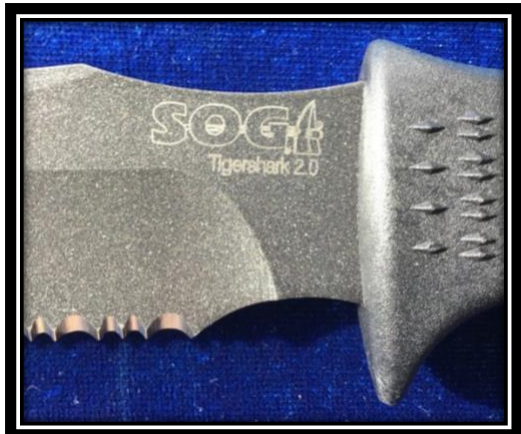
TIGERSHARK 2.0: MODEL: N/A, POWDER COATED W/2" SERRATION, LYNNWOOD, WA, PRODUCED 2008

Note: This knife has the exact size/features as the Seal Team Elite, so it may have been a manufacturing error.