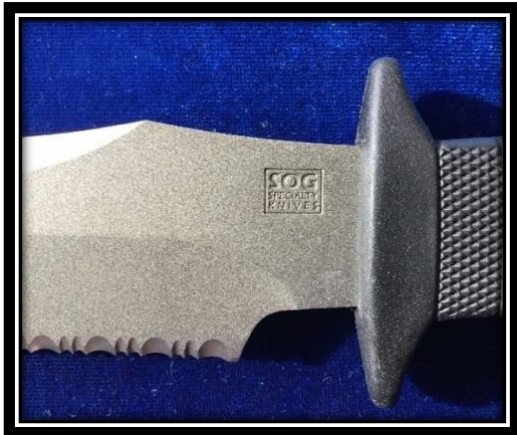
MODEL S5, POWDER COATED, LYNNWOOD, WA. PRODUCED 1996-1998