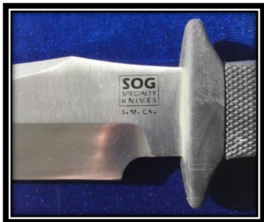
SATIN, SANTA MONICA, CA. PRODUCED 1988-1989